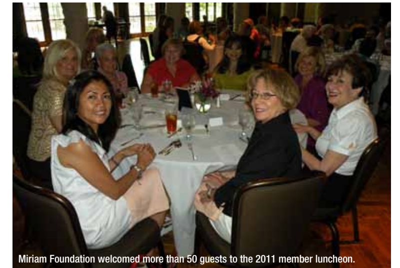
Miriam Foundation welcomed more than 50 guests to the 2011 member luncheon.