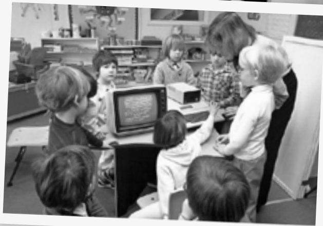
Technology in the classroom has changed from being a novelty to being a necessity.

as exciting new possibilities. If you observe in one of our classrooms, you will see that the Miriam School faculty has committed to transforming our classrooms to meet these new possibilities through the generosity of Miriam Foundation members and a partnership with local community organizations.